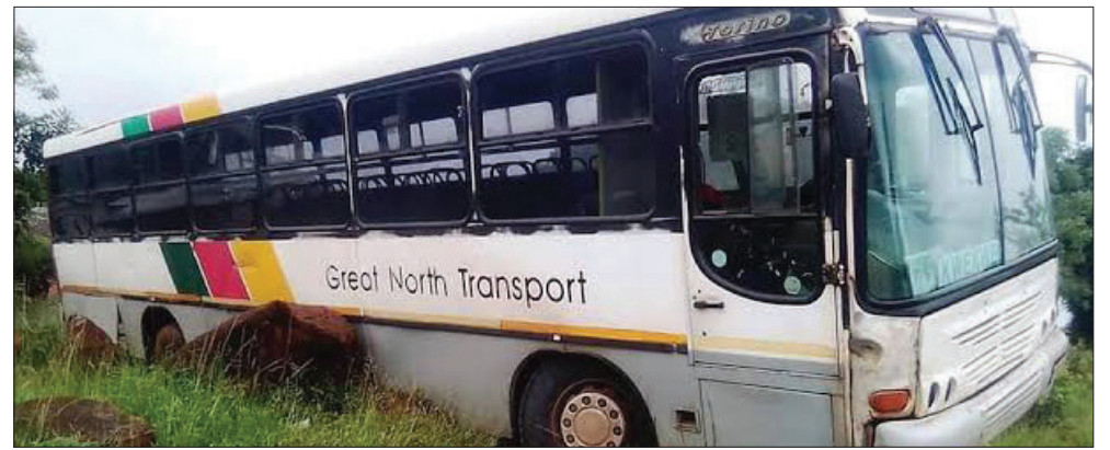
The DA in Limpopo say they will be lodging a criminal complaint against the ailing GNT bus company for operating with un-roadworthy vehicles in the province.