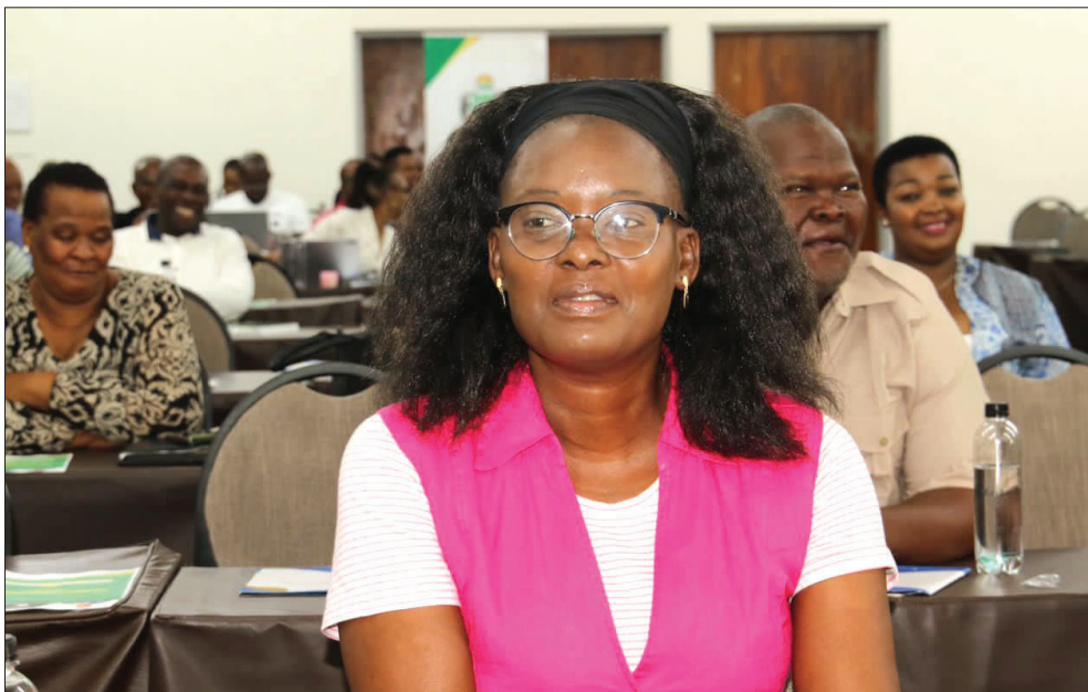
Some of the stakeholders paying attention during the three-day SDM Strategic Planning Session held at the Loskop Valley Resort outside Groblersdal.