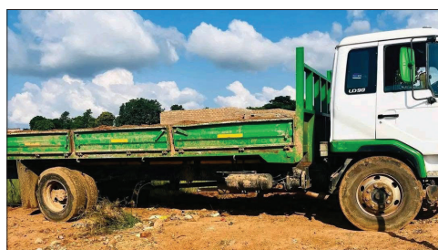
A truck onto which the suspect was caught loading illegally mined sand in Vergelegen C within the Jane Furse policing area.