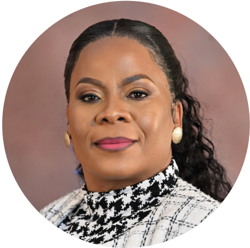
Dieketseng Mashego MEC FOR HEALTH

The call for application(s) is for a period of three (3) years being the Term of office from the date of the appointment by the Member of the Executive Council.