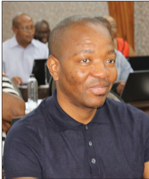
Some of the stakeholders paying attention during the three-day SDM Strategic Planning Session held at the Loskop Valley Resort outside Groblersdal.