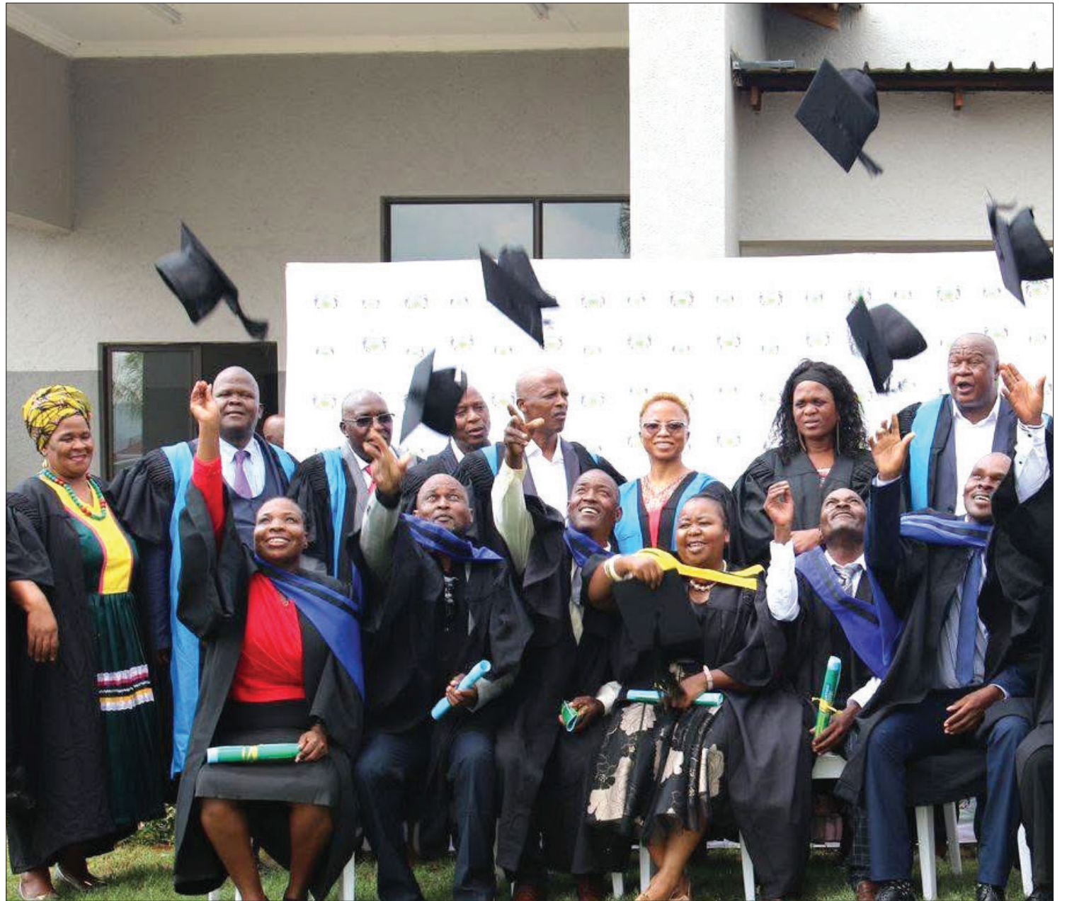
The employees of Sekhukhune District Municipality who graduated as artisans at Boeketlong Lodge in Mogoroane Village on Friday.