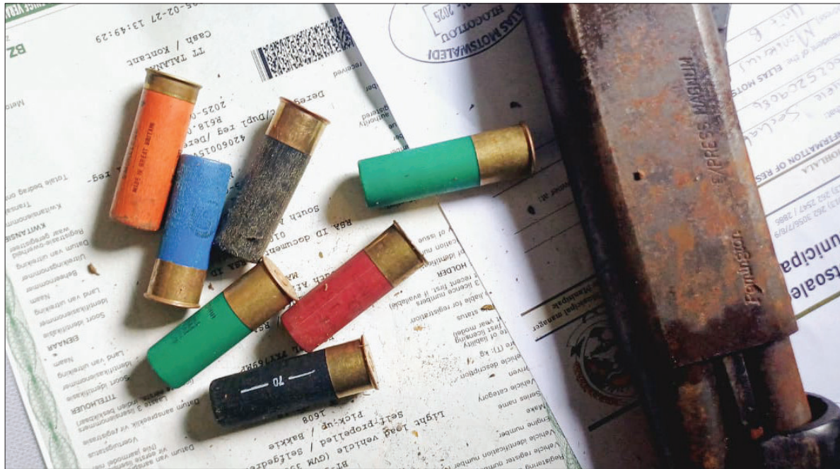
The illegal ammunition which were recovered by the police during a search operation at a residence of a 24-year-old wanted suspect.