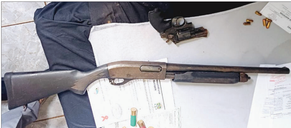
The unlicensed firearms that were discovered by the police at a residence of a 24-year-old wanted suspect.