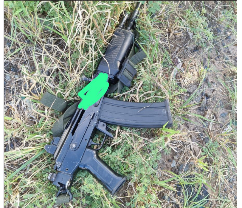
One of the rifles that were stolen during the attack and murder of Sergeant George Modiba was later recovered by the police following an intensive search operation.